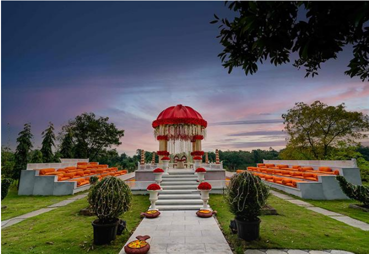
PERFECT WEDDING DESTINATION